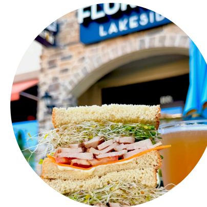
Flurry's Market Lakeside