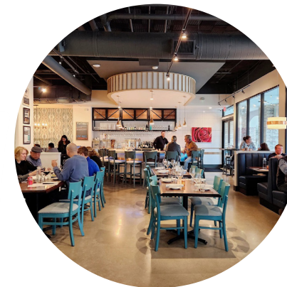
Click Wine Bar + Bites