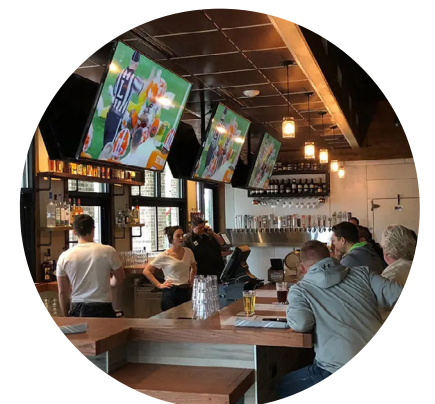
Tavern at Lakeside