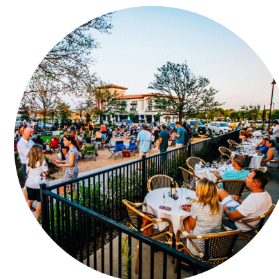
Mio Nonno Trattoria